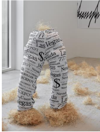
Vegas Pants , 25 June 2018 21 cotton pyjama pants (printed fabric) Dimensions variable Courtesy Galerie Buchholz, Cologne