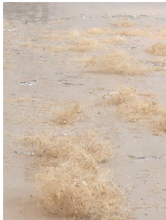
Straw , 3 February 2018 5 x 45 lbs Wood Excelsior floor scatters & pants stuffing Dimensions variable Courtesy Galerie Buchholz, Cologne