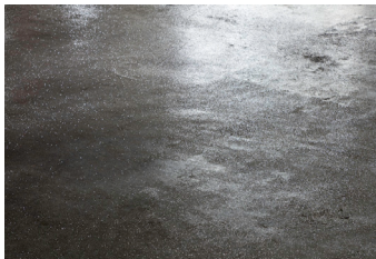
Divine Transportation , 2016 Iridescent glitter Dimensions variable