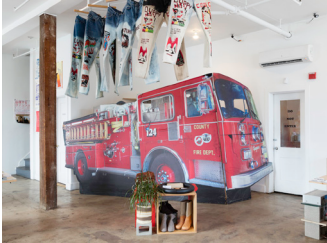
FIRE , 2016 Print on plywood and wood 95 x 168 x 48 inches