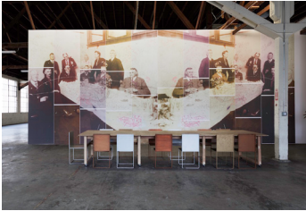
Godfathers , 2016 Inkjet print on paper 180 x 461 inches, installed