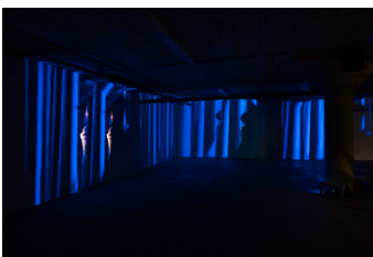
PLEASE (LC) , 2013-2015 Four channel video with sound Dimensions variable Unique