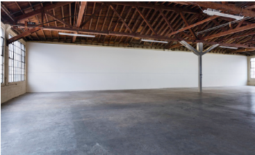
Blue Infinite (Horizon) , 2016 Blue chalk line 100 feet, dimensions variable according to site Edition 1 / 3

LUTZ BACHER "MAGIC MOUNTAIN" MAY 21 - JULY 31, 2016 356 S. MISSION RD LOS ANGELES, CA 90033