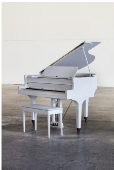
Paradise , 2016 Painted piano with recorded and live tuning Piano: 56.5 x 57 x 64 inches