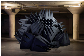
Magic Mountain , 2015 Foam modules 80 x 128 x 126 inches, installed