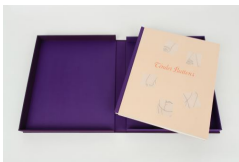
Susan Weil Tender Buttons , 1999 Edition x of 50 Etchings by Susan Weil. Text by Gertrude Stein. 13.5 x 11.5 in (34.3 x 29.2 cm) inches