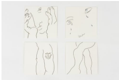
Susan Weil Blind Man's Buff , 1997 Edition x of 50 104 etchings on paper, framed in two parts 28 x 33 in (71.1 x 83.8 cm) inches each