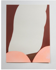
Susan Weil Untitled , c. 1971 Spray paint on paper 24 x 18 in (61 x 45.7 cm)