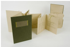
Susan Weil The Reed , 1989 Edition x of 50 Line etchings and mezzotints by Susan Weil. Text by Jalaluddin Muhammad Rumi Translated by Zahra Partovi. 9.5 x 6.5 in (24.1 x 16.5 cm) inches