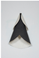
Susan Weil Moon (Half Moon) , 1990 Acrylic on canvas 40 x 21 in (101.6 x 53.3 cm)