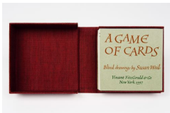
Susan Weil Blind Man's Buff , 1997 Edition x of 50 104 Etchings on paper, edition of 50 5 x 5 in (12.7 x 12.7 cm) inches