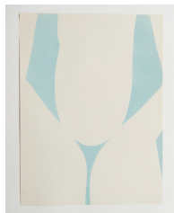
Susan Weil Untitled , c. 1971 Spray paint on paper 24 x 18 in (61 x 45.7 cm)