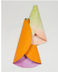
Susan Weil Flower Folds , 1991 Acrylic on canvas 33 x 13 in (83.8 x 33 cm)