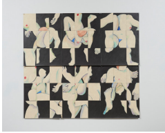
Susan Weil Black Configuration , 2000 Charcoal, watercolor, and acrylic on paper 60 x 66 in (152.4 x 167.6 cm)